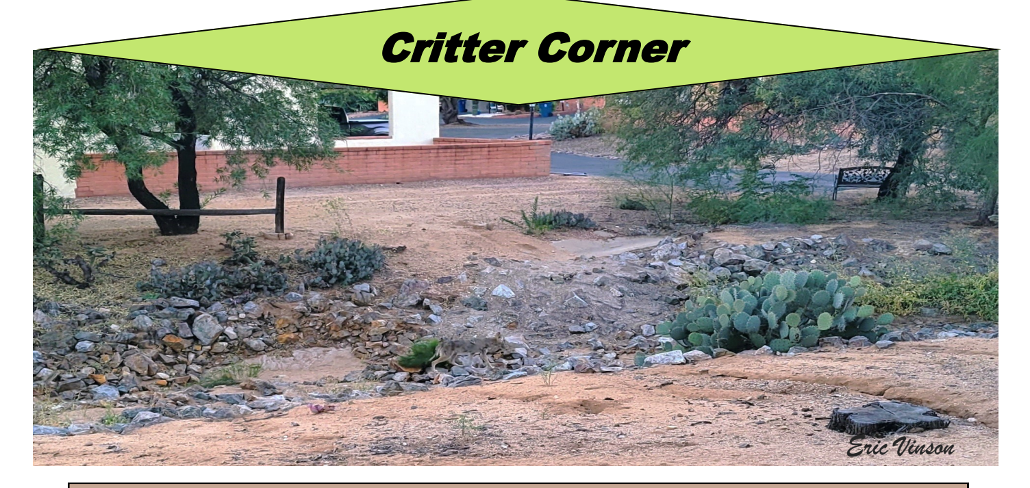
Find the animal in the above photo