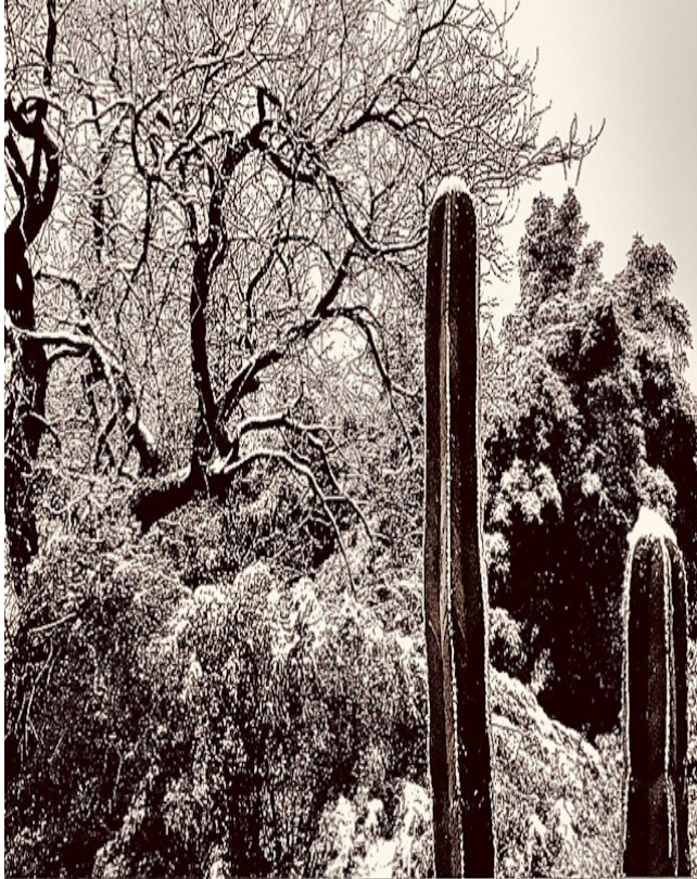
Photograph by Sylvie Robertshaw